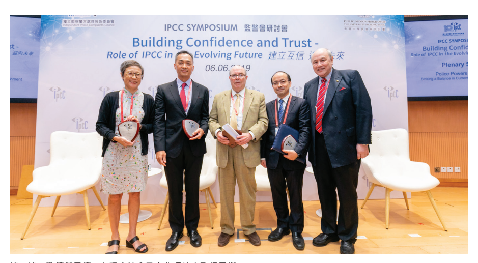
第二節:警權與民權 - 在現今社會及文化環境中取得平衡 Second Plenary Session - Police Powers and Civil Rights - Striking a Balance in Current Social and Cultural Environment