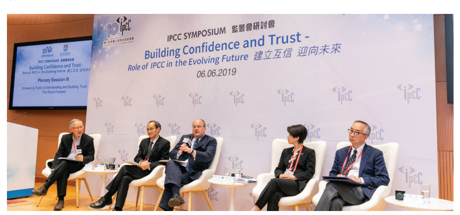
第三節:加強公眾了解及鞏固社會互信關係 - 迎向未來 Third Plenary Session - Enhancing Public Understanding and Building Trust - The Road Forward

研討會設有一系列專題演講及討論,旨在推動知識和經驗交流,探討警察監察制度、平衡警權和民權、加強相互了解、鞏固社會互信關係等相關議題。研討會獲得一眾傑出主持和菁英講者參與,包括歷任的監警會主席、本港政府部門及法定機構代表、本地學者,及來自澳洲、加拿大、紐西蘭和澳門特別行政區的監察機構代表,以及英、美著名學府的學者。是次活動讓各持份者了解世界各地監察機構的變化,有助監警會制定發展策略,以迎合市民日益提高的期望,進一步鞏固本港的公平警察投訴制度。