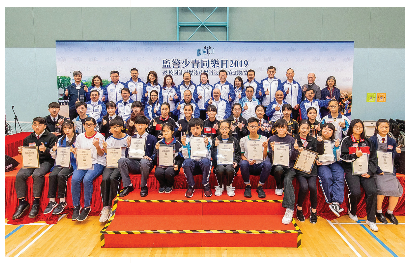
監警會委員及主禮嘉實與一眾得獎學生合照留念。 IPCC Members and officiating guests took photos with the winning students.

The IPCC Youth Day 2019 & School Programme Logo and Slogan Design Competition Award Presentation Ceremony