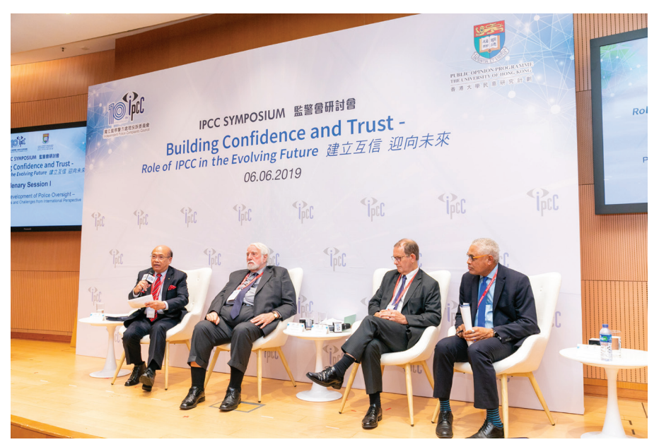
第一節:警察監察制度的海外發展 - 國際視野下的政策、實踐和挑戰 First Plenary Session - Overseas Development of Police Oversight - Policies, Practicalities and Challenges from International Perspective

監警會主席梁定邦博士則表示,隨著社會和政治環境持續轉變,監警會不斷審視 其角色和工作,思考會方、警隊和公眾三方的關係。他強調建立公平公正的投訴 警察制度,攜手提高警隊的服務質素是監警會和警方的共同目標。