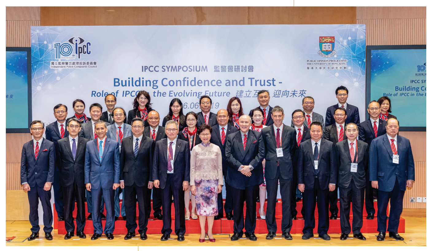
監警會委員及主禮嘉實合照留念。 Group photo of IPCC Members and officiating guests.

IPCC Symposium: "Building Confidence and Trust — Role of IPCC in the Evolving Future"