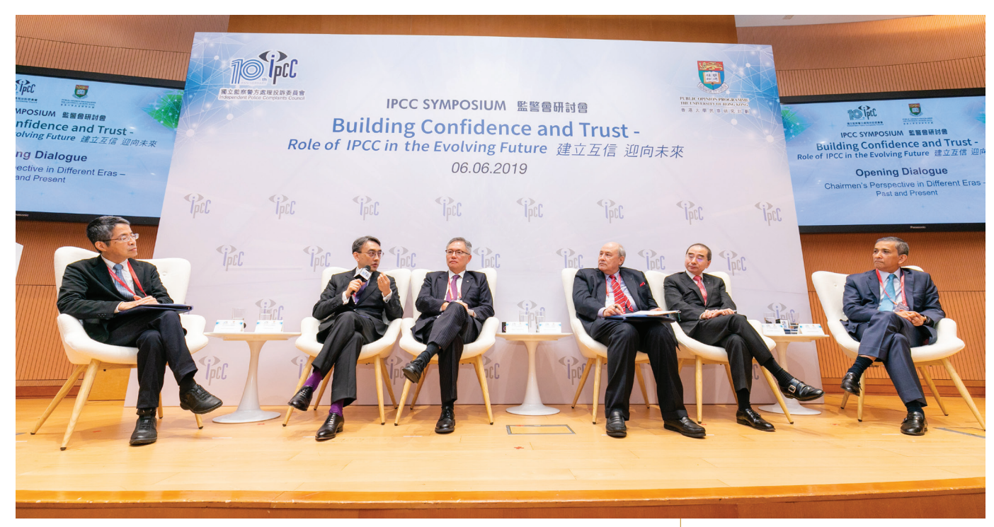
開幕對談:歷任主席及澳門代表的分享 – 過去與現在 Opening Dialogue - Chairmen's Perspective in Different Eras – Past and Present